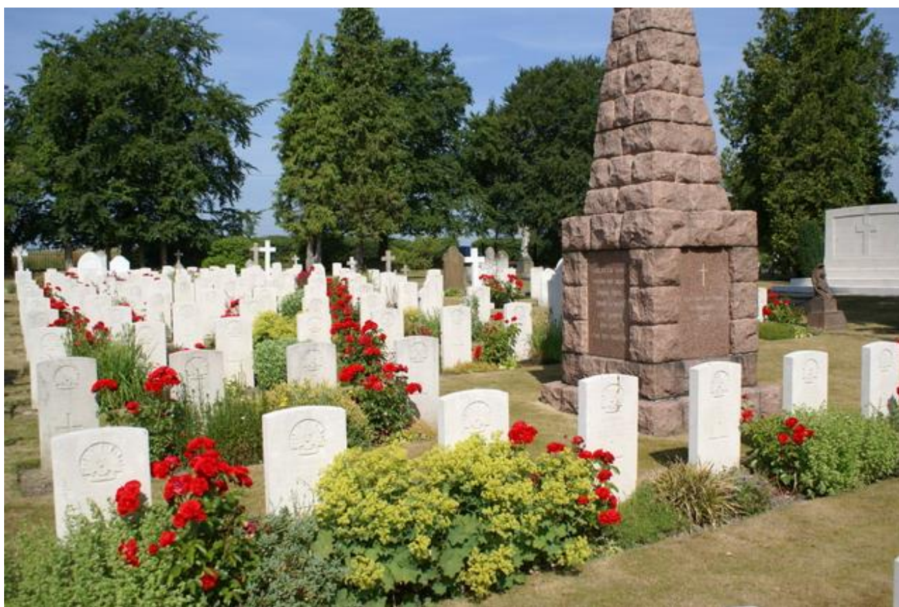
Durrington Cemetery, Wiltshire